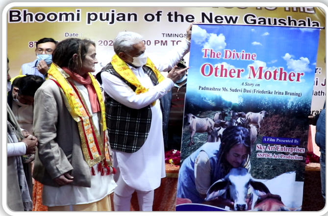
Hon'ble Cabinet Minister Govt. of India Shri Puroshotam Rupala Ji launches the poster of a film "The Other Mother" based on life of Sudevi Mataji on February 08, 2022 at Mukhrai, Radha Kund, Mathura, U.P.