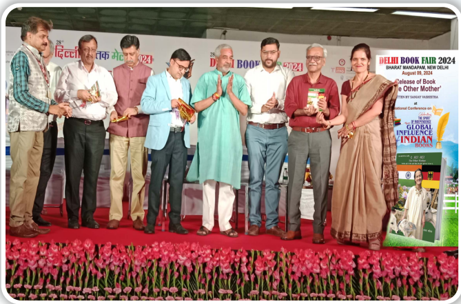
Release of the book 'The Other Mother' inauguration at Delhi Book Fair 2024, on 9th August, 2024 at Bharat Mandapam, New Delhi

Having a huge appeal for animal warfare, the film 'The Other Mother' aims to create awareness towards better care & cure of cows with an objective to support village youth in terms of skill development, soil conservation, management and socio-economic empowerment of poor villagers through manufacturing of unique 'Gauca' brand. It is a sincere effort to catalyze promotional activities of all the stakeholders.