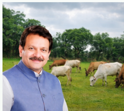
Prof. S.P. Baghel Hon'ble Minister of State for Fisheries, Animal Husbandry & Dairy, Govt. of India at a Gaushala